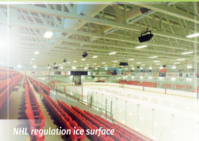
NHL regulation ice surface

If you're looking for a venue with a proven track record of successful ice events, you've found it in Queens Place Emera Centre.